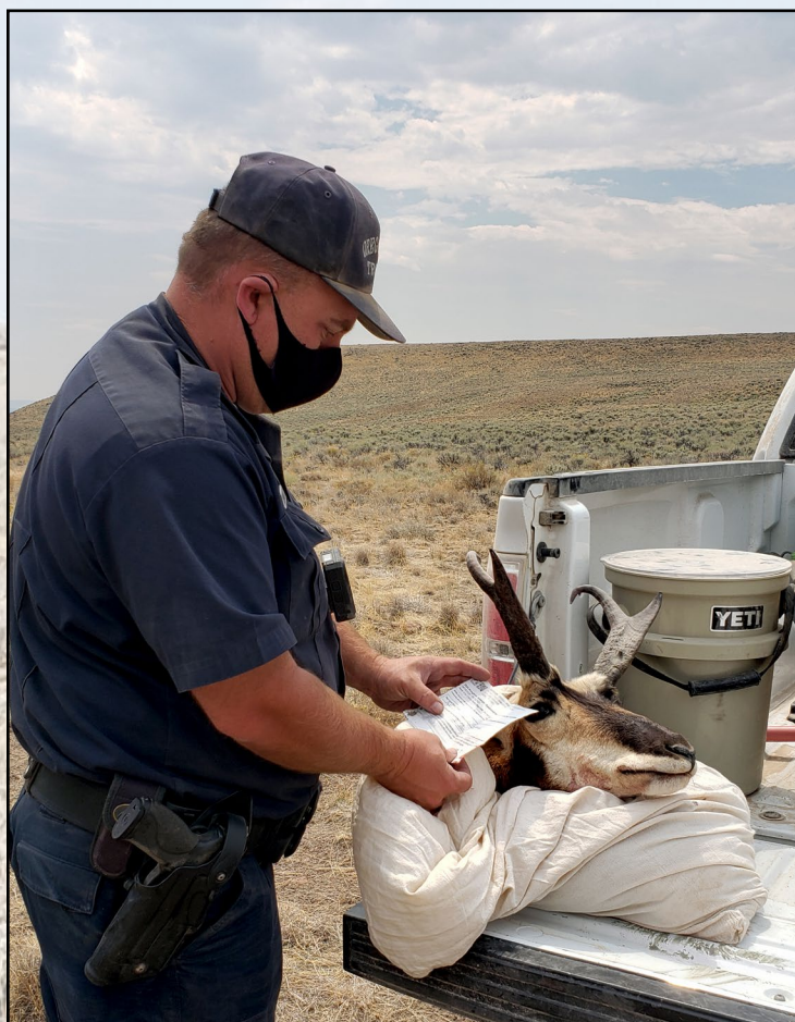
On the cover: A Fish and Wildlife Trooper checks the tag on a harvested antelope.