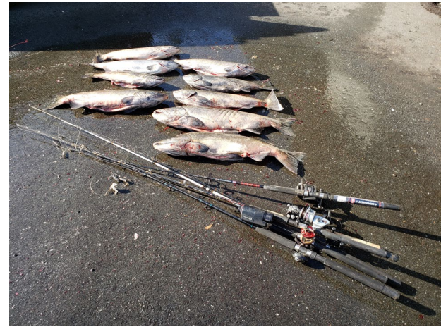
Nine Chinook salmon, six fishing rods, and a night vision scope were seized in the spotlighting case

36 month bench probation 30 days in jail 36 month angling license suspension $100 fine $1,500 restitution to ODFW