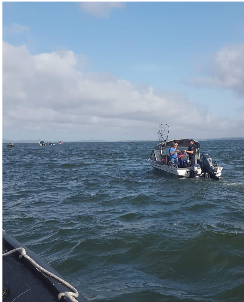
The popular Buoy 10 fishery area is from the Buoy 10 line upstream to a line projected from Rocky Point on the Washington shore through red navigation buoy #44 to the navigation light at Tongue Point on the Oregon shore.

Fish and Wildlife Troopers conducted a boat patrol on the lower Columbia River for the Buoy 10 salmon season. One of the Troopers contacted two salmon anglers aboard a boat. When asked for his angling license and harvest tag, one of the subjects indicated he left his tag at home, but then said that he does "e-tagging." When asked to pull up his tag on his phone, the angler did not have the MyODFW app installed on his phone and seemed unsure of what to do. The Trooper went back aboard the OSP boat and looked up the subject's tagging history and found three separate salmon/steelhead validated electronically during 2020. The angler denied ever giving his login credentials to anyone else and gave a summary of his salmon harvest that was not consistent with what the e-tagging history showed. Charges are pending for Failure to Carry License/Harvest Tag in Possession .