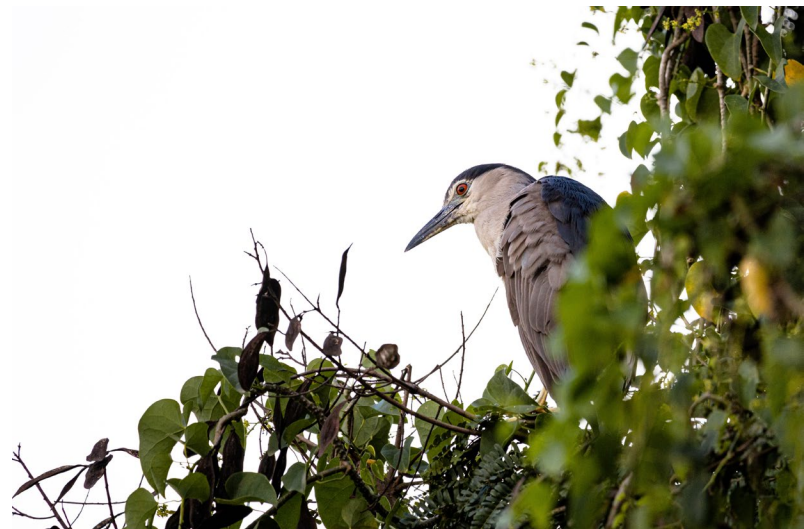
A black-crowned night heron

A Grants Pass Fish and Wildlife Trooper responded to a report of a black-crowned night heron that was stuck in a tree. The black-crowned night heron had fishing line wrapped around its leg and the tree it was in, approximately 20 feet off the ground. With the assistance of ODOT, a bucket truck was brought to the location. The Trooper went up in the bucket and was able to cut the line and the bird was released free of any injury.