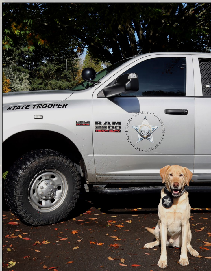
On the cover: Fish and Wildlife Conservation K-9 Buck