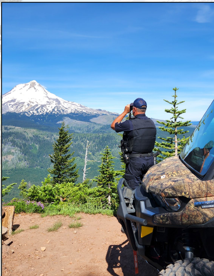
On the cover: A Fish and Wildlife Trooper on patrol in the Mt. Hood National Forest