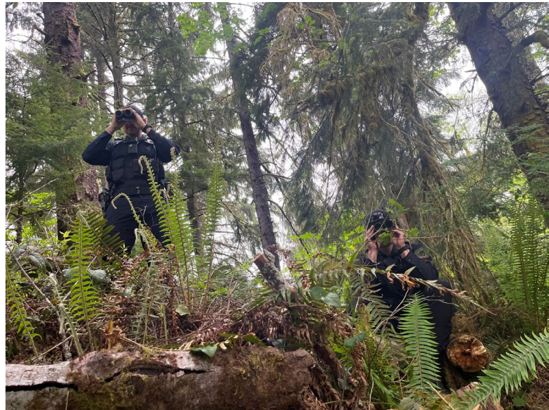
Fish and Wildlife Troopers conducting surveillance on Gnat Creek

A Fish and Wildlife Sergeant and Trooper were dispatched to Gnat Creek after reports of subjects snagging at Gnat Creek Hatchery. A group was observed angling for some time before being contacted. One subject was contacted with no license or tag in possession after taking two hatchery Chinook. The subject was found to have a valid license and tags. The subject was cited for Fail to Immediately Validate Harvest Card , and warned for Continue to Angle after Retaining Daily Limit, and No Valid License/Tag in Possession .