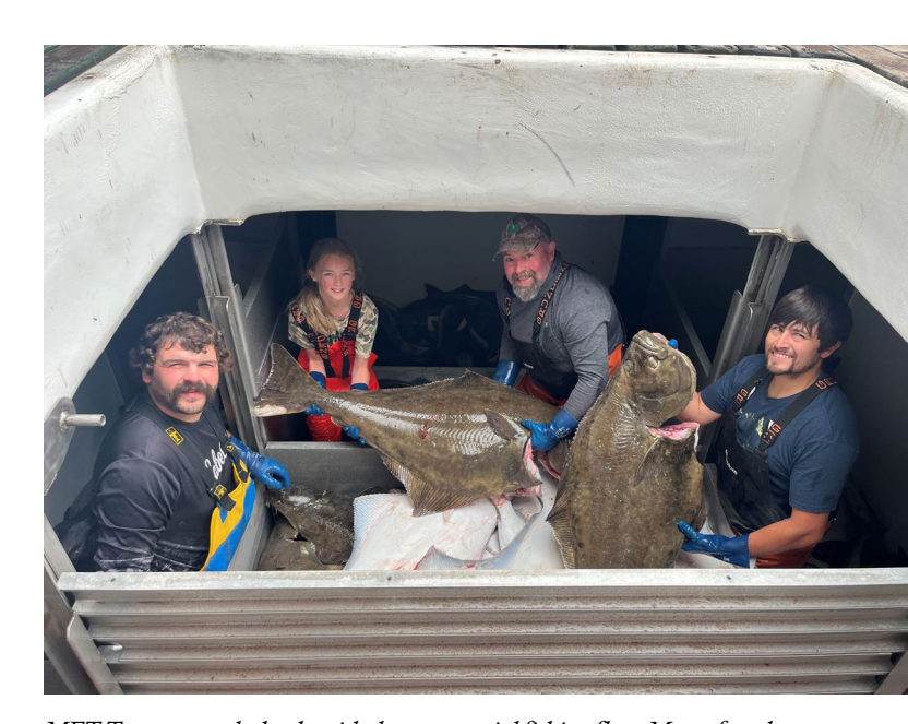
MFT Troopers work closely with the commercial fishing fleet. More often than not, fishers and their crew follow the regulations and the relationship between law enforcement and the fleet is a positive one. This offload of commercial halibut was in Winchester Bay during the first commercial fish opener. It's not uncommon for everyone in the family to help out to ensure the future of their business is passed down from generation to generation.

Astoria Fish and Wildlife Troopers conducted ocean patrols focusing on ocean salmon and rockfish anglers. Citations were given for a variety of violations including Using Two Rods, Barbed Hooks, and Fail to Validate Harvest Card. One guide was cited for Aiding in a Fish and Wildlife Violation when it was discovered two of his clients had caught salmon hours before and had not tagged them. A records check showed this same guide had been cited just a couple months prior when he allowed his clients to keep seven rockfish each when the limit was five.