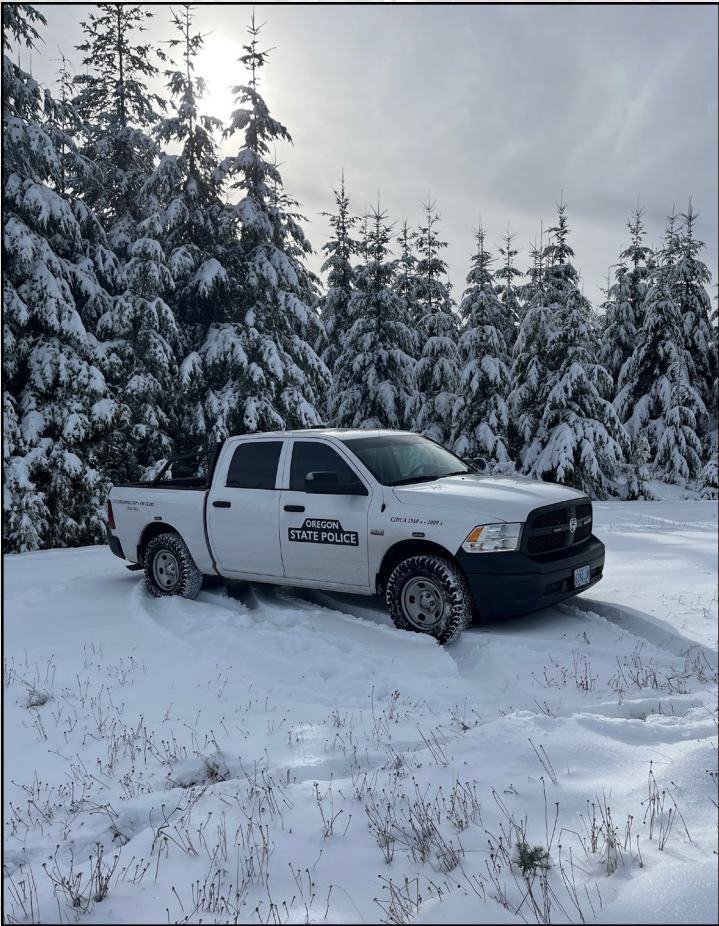
On the cover: A Fish and Wildlife retro patrol truck at Molalla Tree Farms in Clackamas County