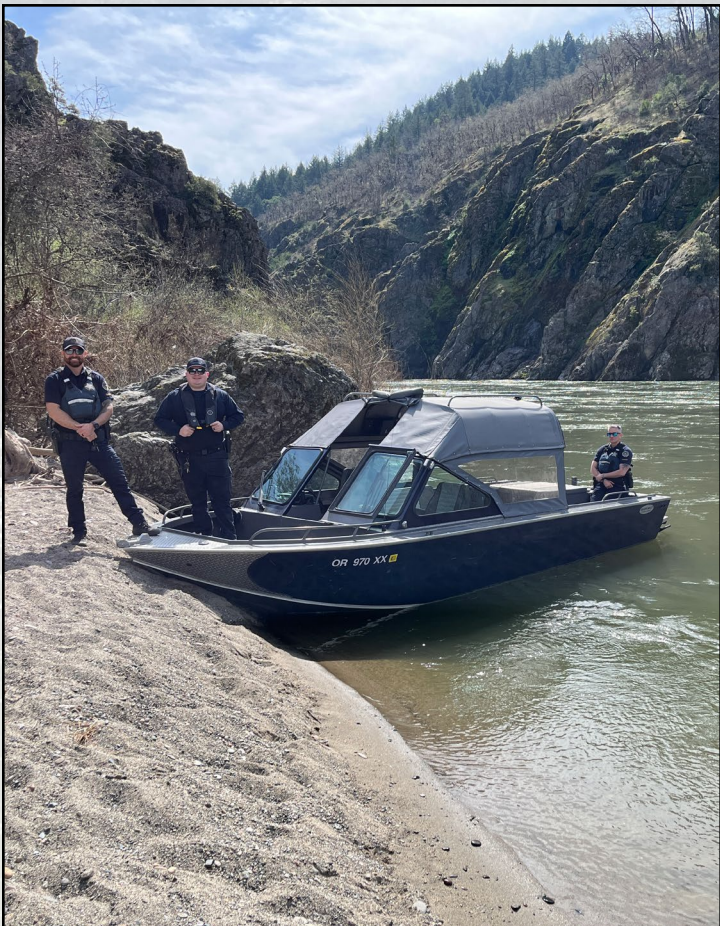
On the cover: SW Region Fish and Wildlife Troopers on a boat patrol of the Rogue River in Josephine County