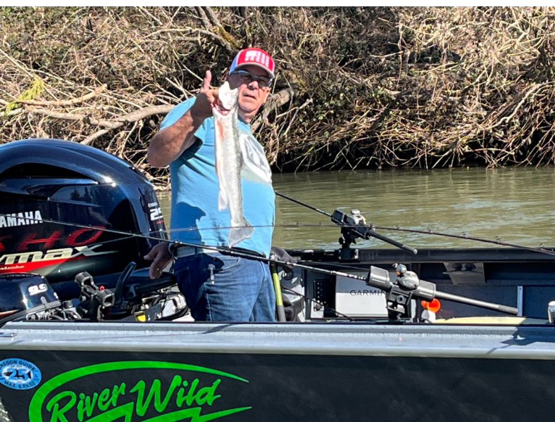
A happy angler poses with his legally harvested hatchery steelhead

Between its epic rivers and 350 miles of ocean coast, Oregon boasts a stunning diversity of fishing grounds, where anglers get to face some of the finest game fish on the planet. The bulk of Oregon's freshwater angling takes place from early spring to fall, with February and March being the peak of winter steelhead angling. The southwest region of the state contains some of the best rivers for steelhead angling on the west coast, with the Umpqua (pictured above), Rogue, and Chetco Rivers and their tributaries.