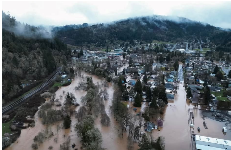
Recent flooding in Drain, Oregon

Winter steelhead angling regulations are complex and can change during the season, so anglers are strongly encouraged to check the ODFW website ( myodfw.com ) and eregulations.com/oregon prior to angling. ODFW implemented temporary harvest restrictions on the Illinois and Rogue rivers for winter steelhead season, and a relatively new Rogue-South Coast Steelhead Validation is required for all winter steelhead anglers fishing in the Rogue basin, or on the south coast. Both of these regulations are in place from December 1, 2024, through April 30, 2025. As of April 1, the Rogue is the only winter steelhead opportunity on the south coast, as all of the smaller south coast rivers closed to all angling at the end of March.