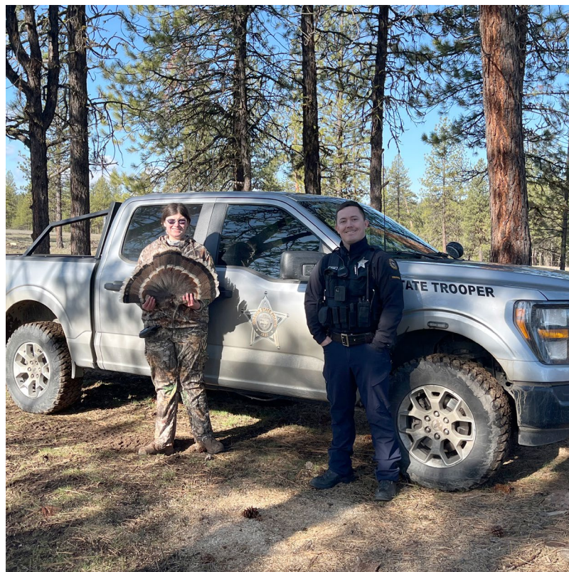
A legal youth turkey hunter poses with a Fish and Wildlife Trooper

Hermiston and Heppner Fish and Wildlife Troopers patrolled the Bridge Creek Wildlife Area (BCWA) south of Ukiah. One successful youth turkey hunter was contacted (photo below). The youth and her father reported ATV operators riding cross county and interfering with her hunt. Several people with ATVs were contacted at camps in the area but none were caught actively riding in violation of the Travel Management Agreement. Overall, no one was reported or located in the BCWA. One stranded vehicle was located and assisted with being removed from the deep snow. In all 85 people were contacted with four warnings being issued for equipment and seatbelt violations.