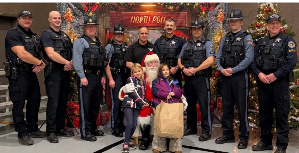
A Baker City Fish and Wildlife Sergeant and Troopers, and Patrol Troopers participated with the annual Shop with a Cop event in Baker City.

Fish and Wildlife and Patrol Troopers participated in the annual Shop with a Cop Christmas Event at Walmart in Ontario. The Oregon State Police was joined by the following partner agencies at the event: Malheur County Sheriff's Office, Ontario Police Department, Snake River Correctional Staff, Fruitland Police Department, Payette County Sheriff's Office, and the Nyssa Police Department. The kids all received a gift card of approximately $150 to shop for their family members and or themselves. Santa Claus made an appearance at the event and it was a great success.