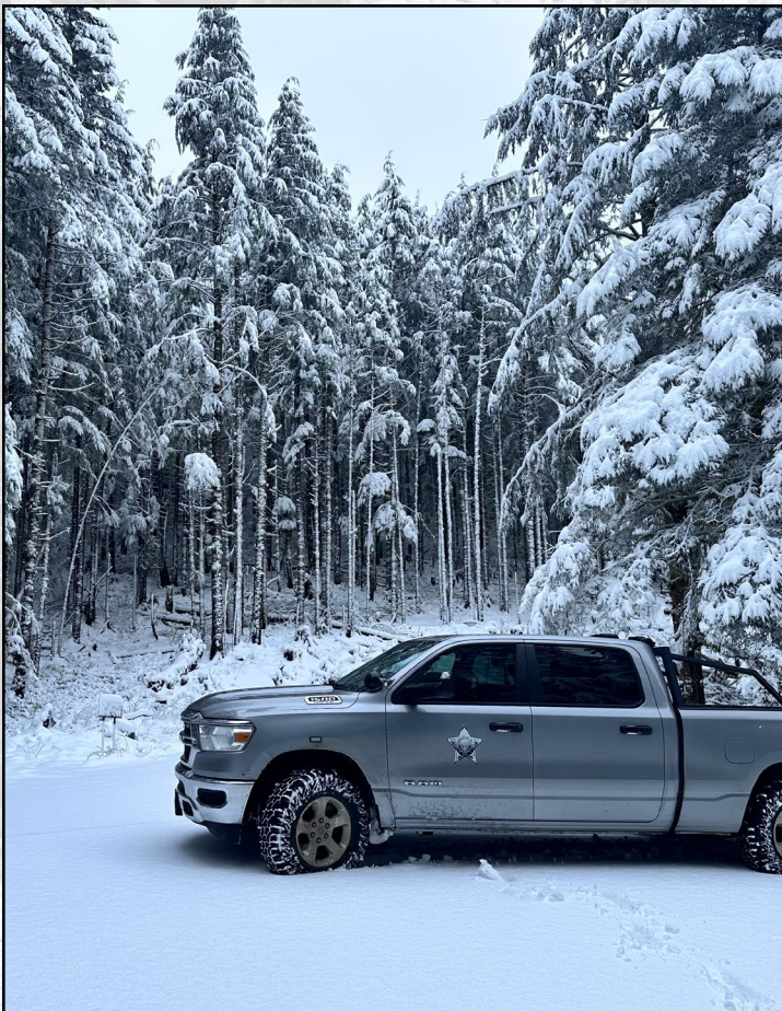
On the cover: A Fish and Wildlife patrol truck on a national forest road east of Lincoln City