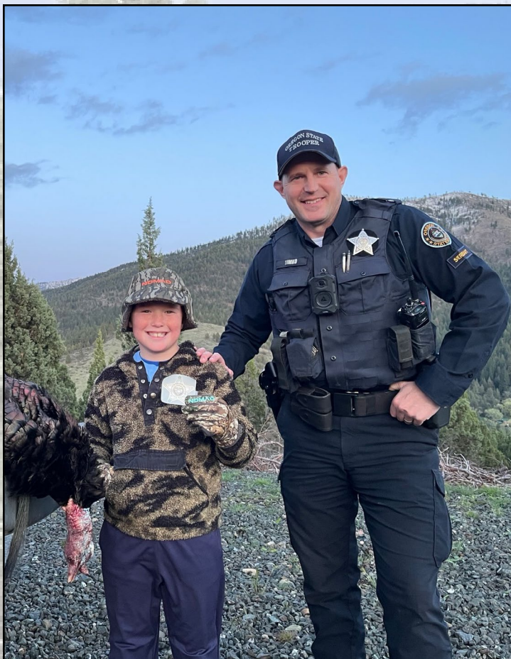
On the cover: A John Day Fish and Wildlife Sergeant with a youth hunter and his first turkey, harvested in the Northside unit