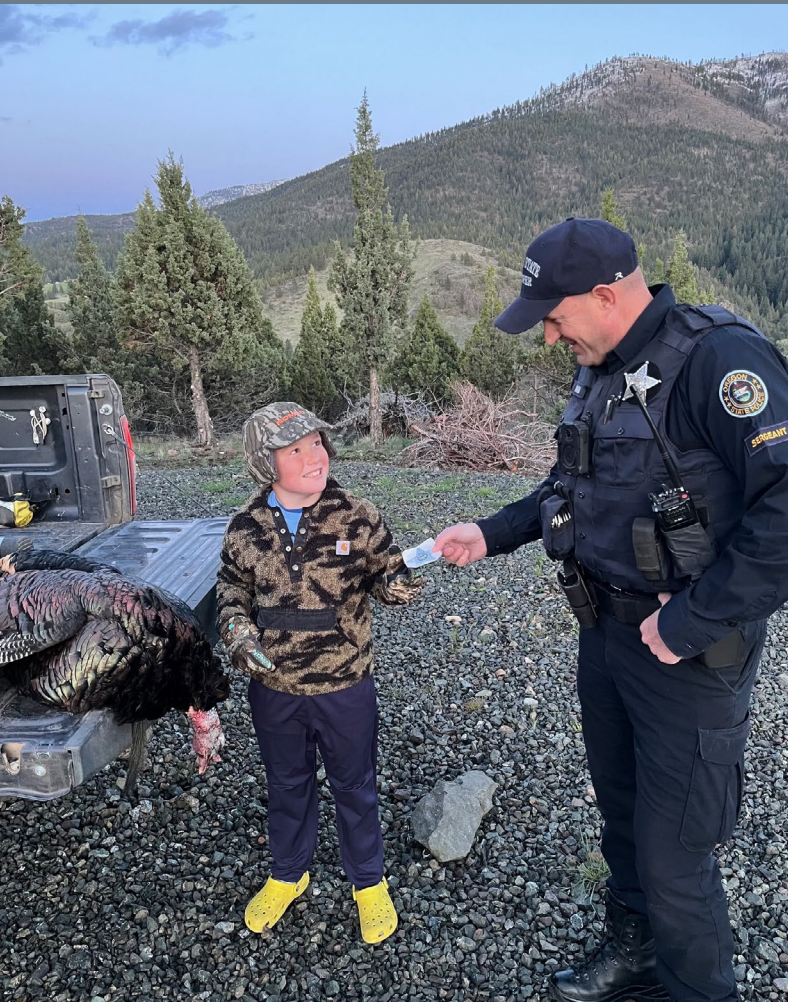
A John Day Fish and Wildlife Sergeant gives a Junior Trooper sticker to a youth hunter who legally harvested his first turkey in the Northside unit.

It may come as a surprise to many Oregonians, but wild turkeys are not native to our great state. In fact, it was not until the early 1960s that Merriam's subspecies were successfully introduced, with Rio Grande's arriving in 1975. Since then, the wild turkey population has expanded in population and scope throughout Oregon providing excellent hunting opportunity during both the spring and fall. Oregon also has a wonderful, liberal bag limit allowing for three gobblers to be taken during the spring and two birds during the fall. The spring season, beginning mid-April and extending through the end of May, allows for plenty of time to take part and the youth only spring hunt provides further, limited opportunity for youth only wild turkey hunting.