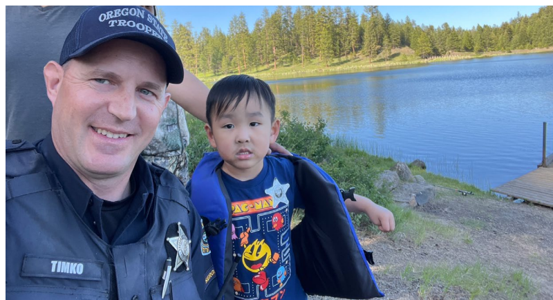
A Sergeant poses for a photo with a child at Bull Prairie Lake

A Fossil Fish and Wildlife Trooper conducted a multi-day enforcement float patrol with the BLM River Rangers over Memorial Day weekend on the John Day River from Clarno to Cottonwood Park. The focus of the patrol was boat inspections and angling compliance checks. Additional duties included clean-up of camp sites and inspections of known archaeological sites for recent looting. The patrol ended with 142 boaters and anglers checked, 48 boat inspections, three boating warnings, one angling warning, and one citation for No Angling License.