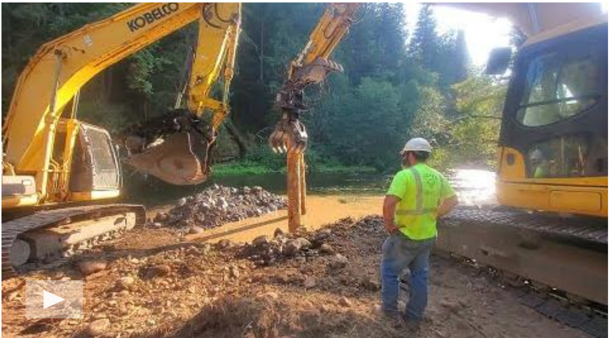
▲ Photo 8. Screenshot of large wood being placed in side channel of the Clackamas River on the Confederated Tribes of Warm Springs property. Click on the image above to watch a short video produced by the Clackamas River Basin Council to learn more about this collaborative project.

This OWEB restoration grant for $233,338 leverages $426,000 in match provided by the Confederated Tribes of Warm Springs. In the summer of 2024, the Clackamas River Basin Council (CRBC), in collaboration with the Confederated Tribes of Warm Springs, implemented a large-scale restoration project on tribally owned land in the upper Clackamas River watershed. The project addressed unauthorized camping and site modification at the hot springs, restored Clackamas River connectivity to two relic side channels, installed large wood to benefit fish habitat, and installed riparian plantings on seven acres. This project benefits salmon, steelhead, bull trout, and Pacific lamprey.