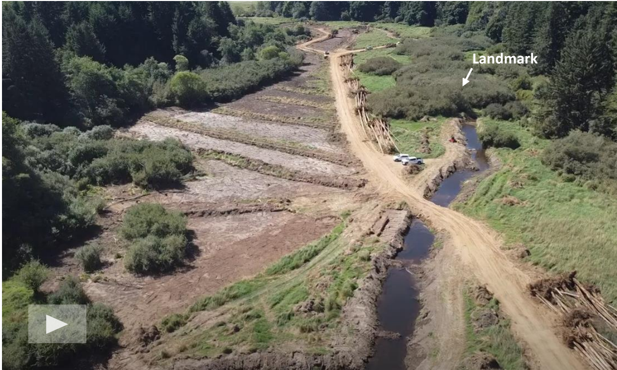
▲ Photo 2. During construction conditions along Fivemile Creek, located upstream of Tahkenitch Lake, Douglas County. Click on the image above to watch a short drone video of this restoration project area.