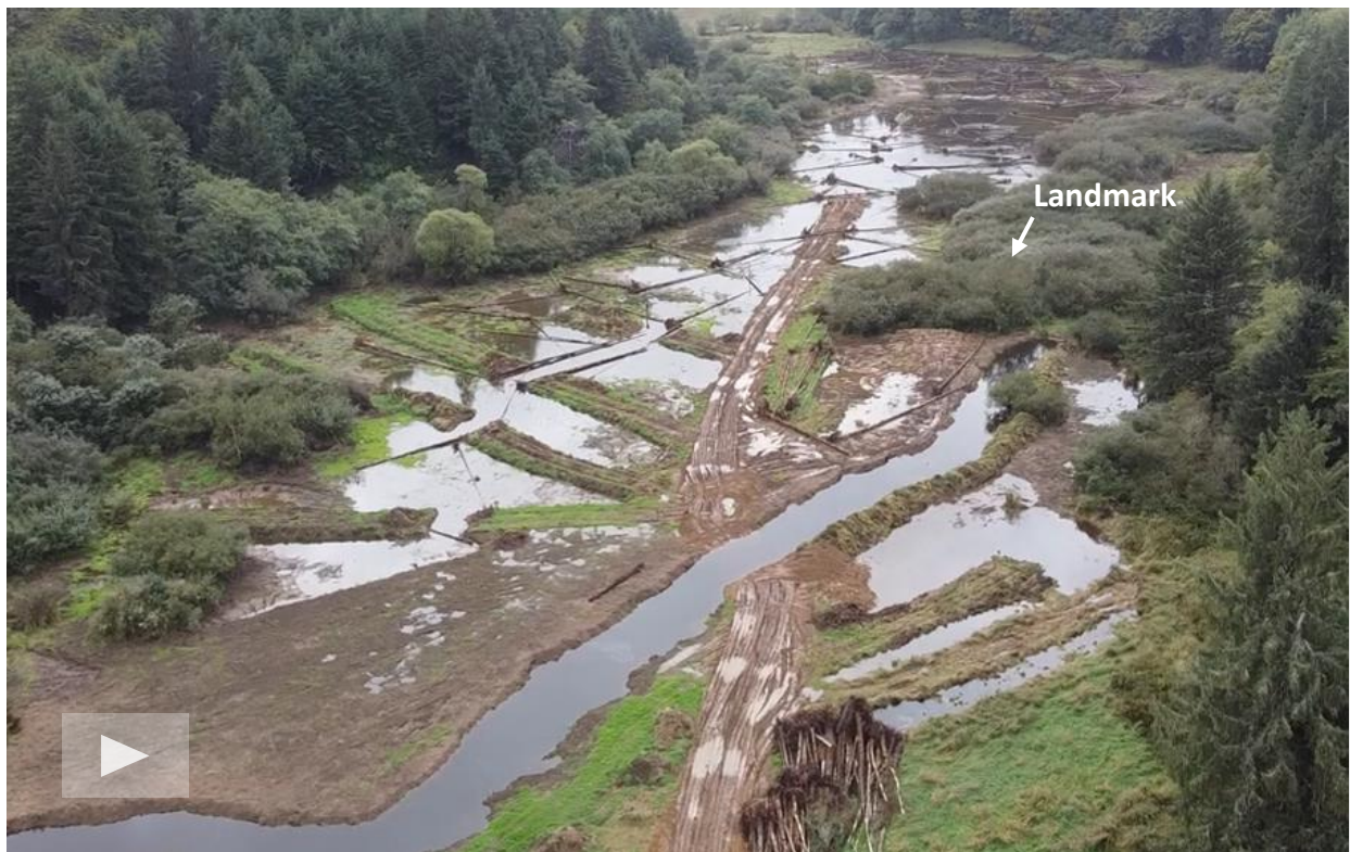
▲ Photo 3. Post-restoration conditions completed in 2023 by the Confederated Tribes of Siletz Indians along Fivemile Creek to increase channel complexity and floodplain connection, additional funds from OWEB were provided in 2024 to complete Phase 2 of this restoration project. Click on the image above to watch a short drone video of this restoration project area.