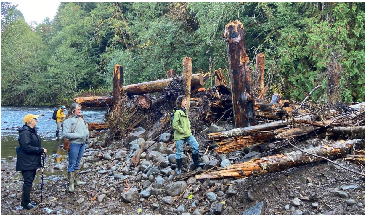
▲ Photo 4. Field tour of completed stream restoration project funded by OWEB's FIP grant program along the Clackamas River on the Confederated Tribes of Warm Springs Property at Austin Hot Springs.

OWEB will use these results to inform the Natural and Working Lands grant offering, with the Open Solicitation and OAHF applications opening in early 2025.