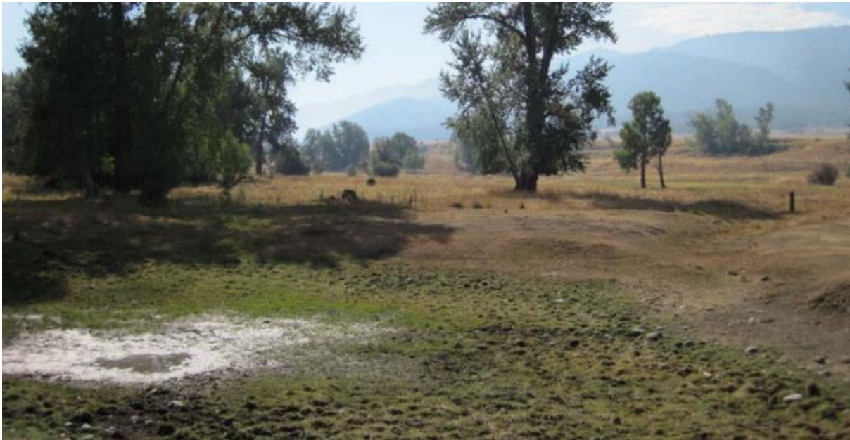
▲ Photo 5. Pre-restoration conditions on the Lostine River.