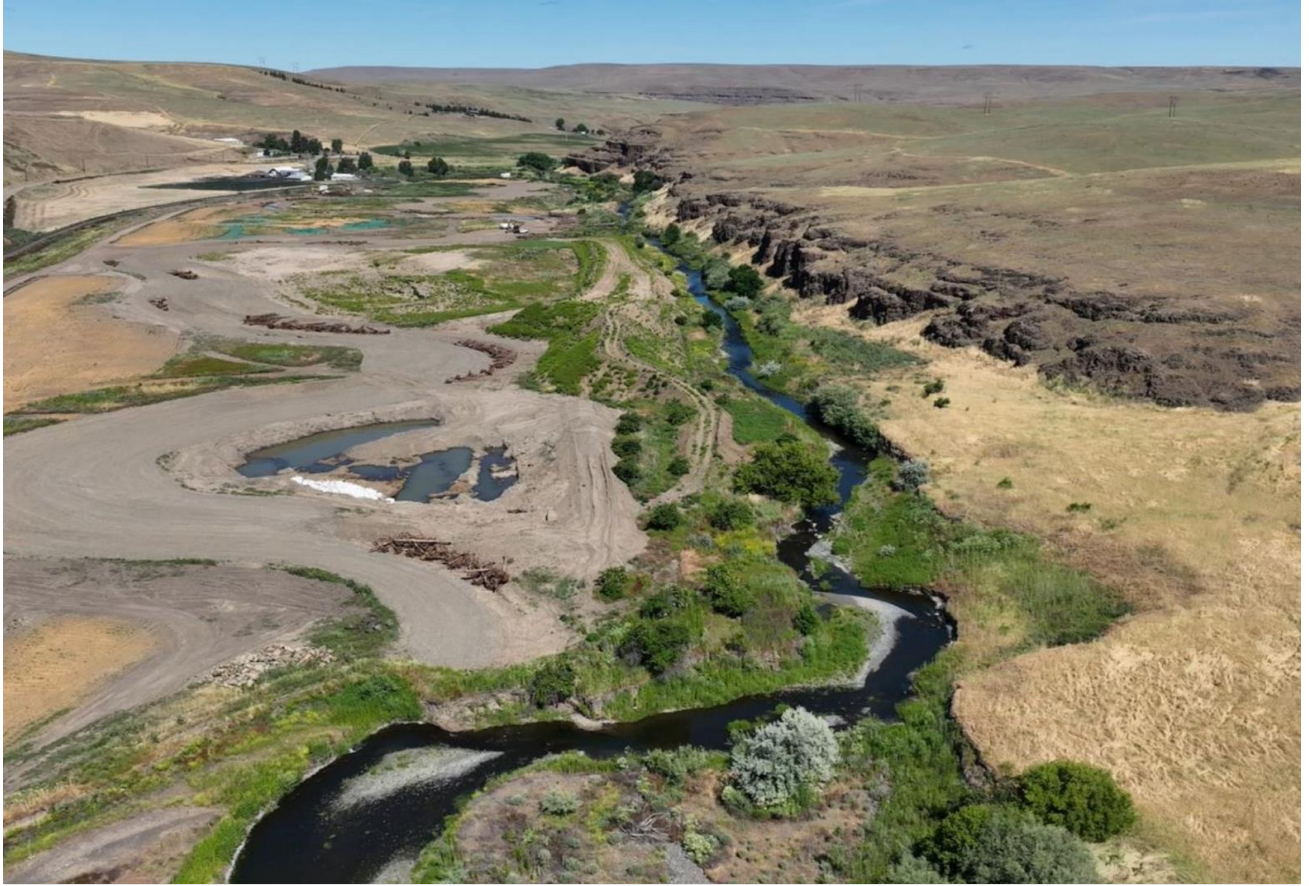
▲ Photo 10. Mid-construction conditions along Birch Creek. Restoration implemented by the Confederated Tribes of the Umatilla Indian Reservation in 2024 with funding from OWEB.