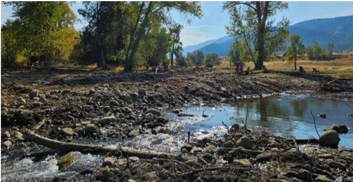
▲ Photo 6. Post-restoration conditions in the Lostine River. Restoration was implemented with OWEB funds by the Nez Perce Tribe in 2024.