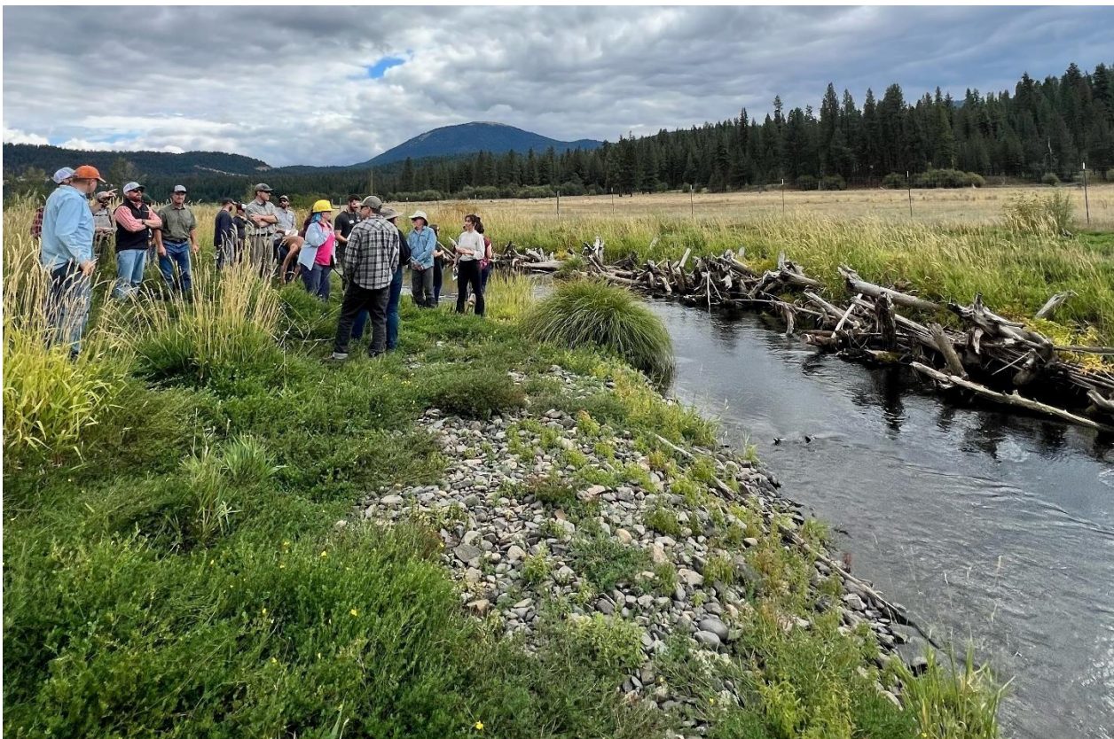
▲ Photo 9. Field tour of Confederated Tribes of Warm Springs' Oxbow Conservation Area located along the Middle Fork John Day River, September 2024.

In May 2024, OWEB awarded a Telling the Restoration Story grant in the amount of $39,978 to the Confederated Tribes of Grand Ronde to use existing data to show how OWEB funds have supported the integration of Traditional Ecological Knowledge (TEK) into prairie restoration. With participation from the Institute for Applied Ecology (IAE), the project will summarize three phases of collaboration on Plants for People efforts. The products will provide an important example of how to integrate TEK with the OWEB funding model (OWEB has funded many restoration projects through Lottery funds, which come with some constitutional constraints). There is growing awareness about the challenges of restoring upland sites related to removing historic land management practices by tribes who created these habitats, but there is a lack of understanding of how to reintroduce TEK as a restoration strategy within the OWEB funding model. The proposed products from this project are anticipated to connect TEK with fish and wildlife habitat restoration, while also describing important cultural connections.