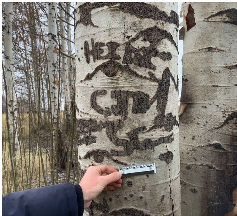
Figure 12. Arborglyph on aspen tree