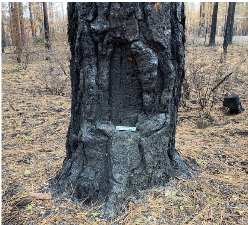
Figure 11. Example of peeled pine.