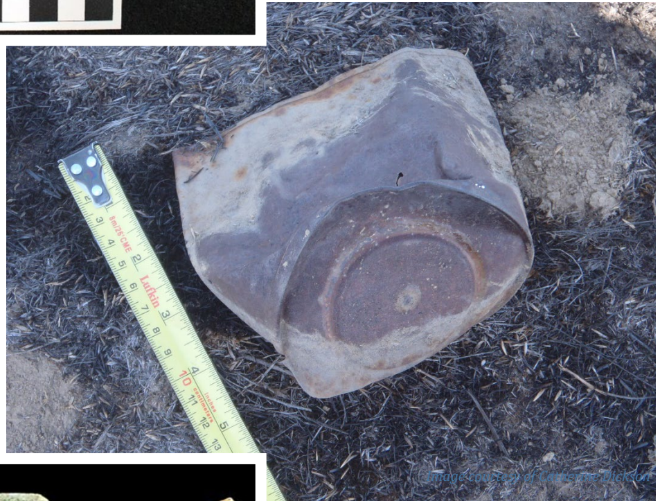
Soldered Top Can