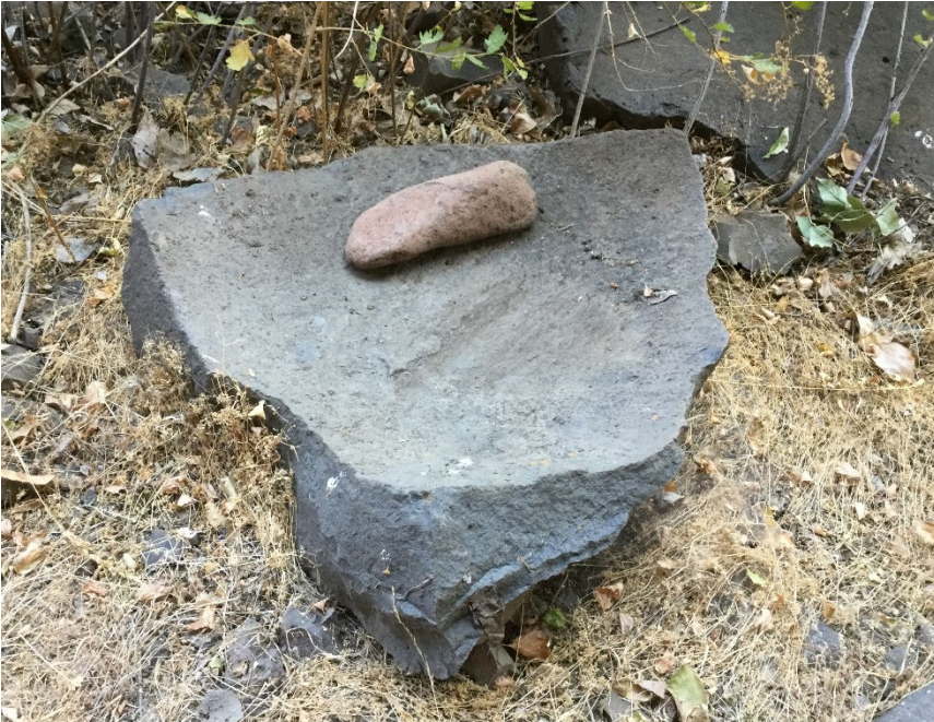
Ground stone Mortar and Pestle