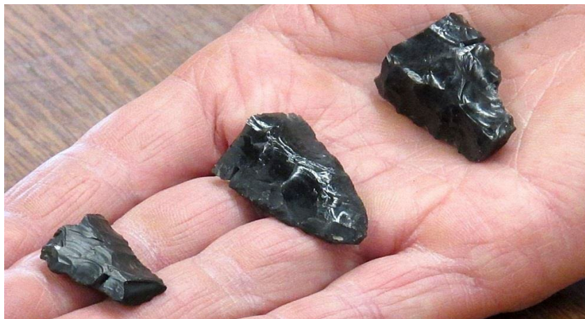
Figure 2. Stone projectile points