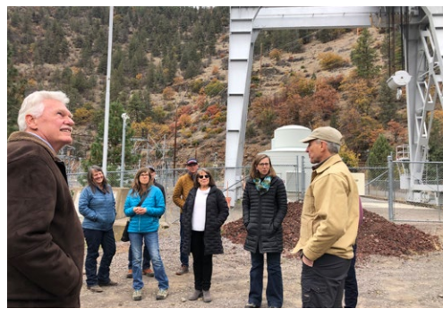
WEB visited the JC Boyle Dam Removal site at the last Board Meeting.

Priority 3 Community capacity and strategic partnerships achieve healthy watersheds