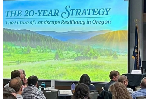
20-year Landscape Resiliency Strategy Summit.

Community and agency collaborative efforts in Klamath Basin have focused on addressing water quality and quantity issues .