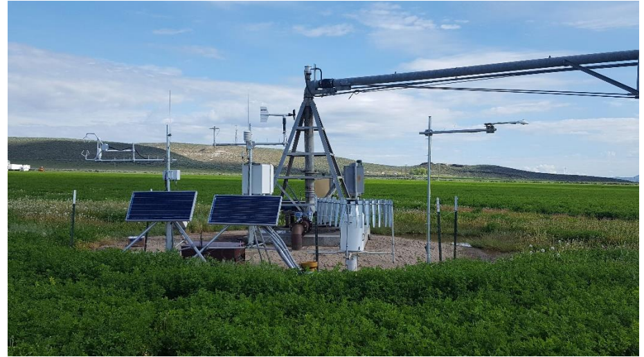
Weather station in Harney County

Over the next year, OWRD will be leading the effort to update the IWRS. Agencies, tribes, stakeholders, and the public will all have an opportunity to contribute to the next IWRS.