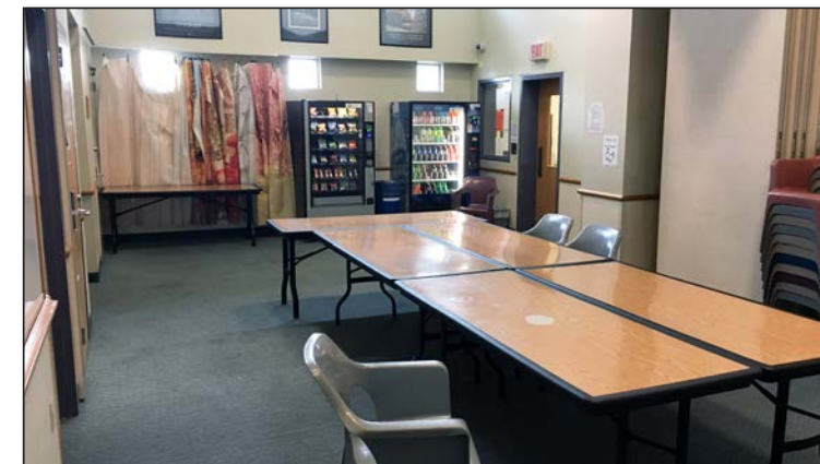
Visits happen in Oak Creek's large conference room.