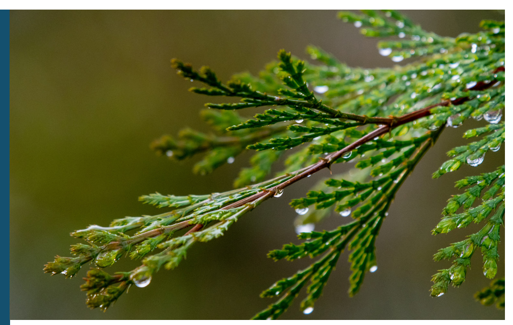
Incense cedar (calocedrus decurrens)

Employer Service Center Employer support email Contact PERS