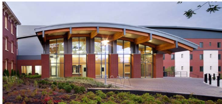
Kirkbride Building ↗

Be sure to bring your ID and inform the folks at the desk that you are here for a PSRB hearing. They will screen you in the lobby and someone from security will bring you back to the hearings room. Please note that OSH is a secure facility and thus there may be certain items you are unable to bring in to the hearings room. However, OSH does provide lockers for safekeeping in the event you have an item that cannot be brought into the hearing room. Depending on the docket day and where we are in the schedule, security may take you directly into the hearings room or take you to a conference room to await the hearing.