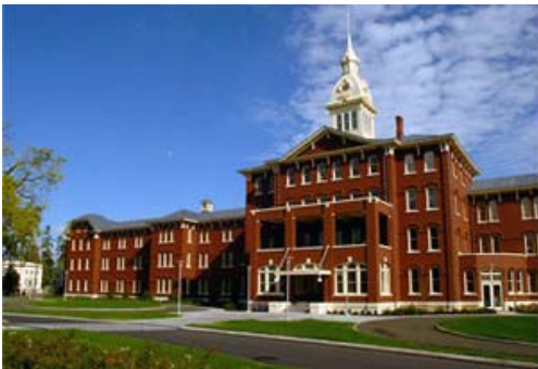
Museum part of OSH ↗

PSRB hearings are held in the Kirkbride building , which is a dark red building located at the top of the hill with a roundabout in front (to the right of the flagpoles). Once you arrive, you will have to sign in at the “Comm Center” (front desk).