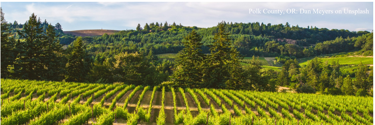
Polk County, OR