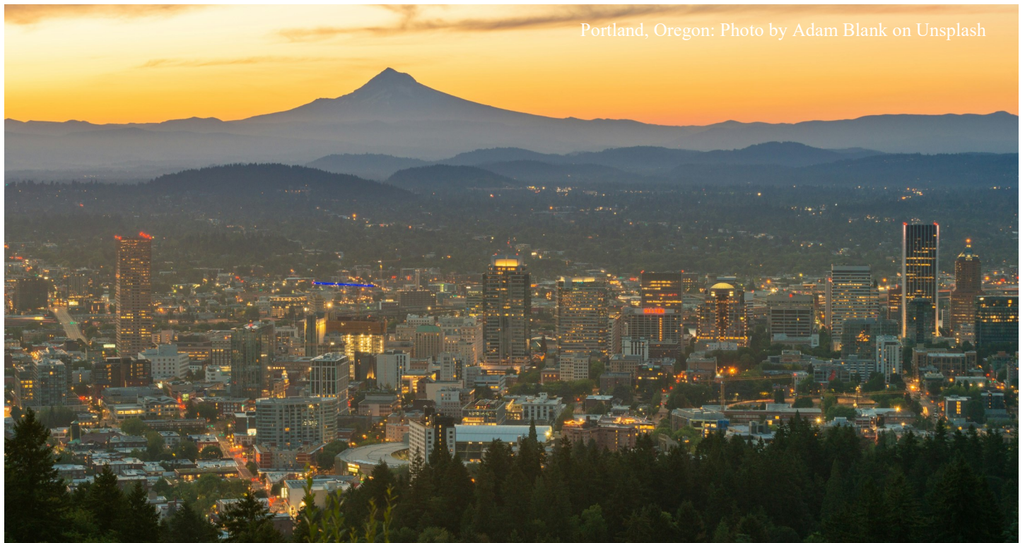
Portland, Oregon: Photo by Adam Blank on Unsplash

* Committee meetings are tentatively scheduled. Please also visit our Board Meetings Webpage .