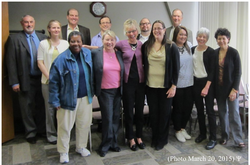
(Photo March 20, 2015) Ψ