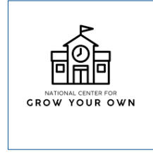
National Center for Grow Your Own 2026 Convening