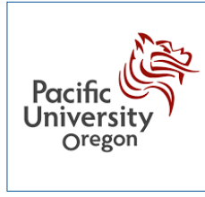
Pacific University Related Training Provider