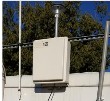
DEQ PM2.5 Sensor node

A particle counter, fan, air pump, modem, data logger and heater fit into a weather tight plastic case to comprise the sensor node. Its box is 18 inches high, 12 inches wide and 8 inches deep, and hangs outside on a pole or building. It runs on low amp 120V A/C power or solar panels.