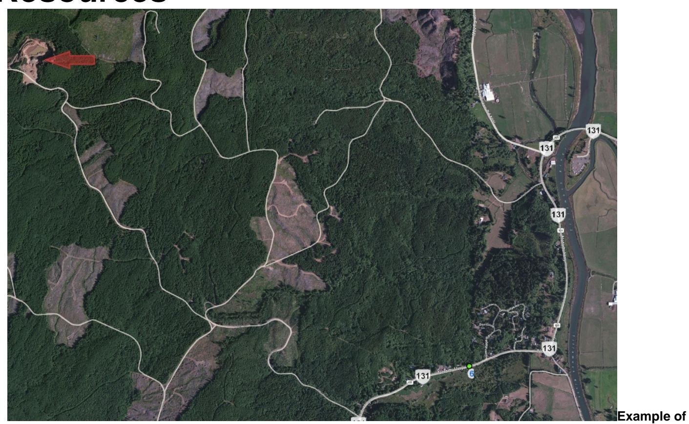
General Location Map