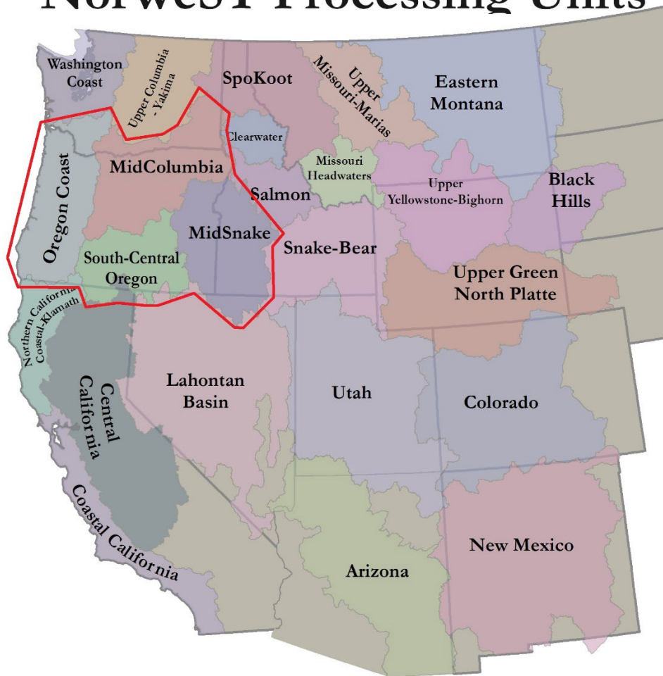
Figure 1: Map of NorWeST model area with Oregon-relevant PUs highlighted. Figure adapted from NorWeST model website ( https://www.fs.fed.us/rm/boise/AWAE/projects/NorWeST.html ).