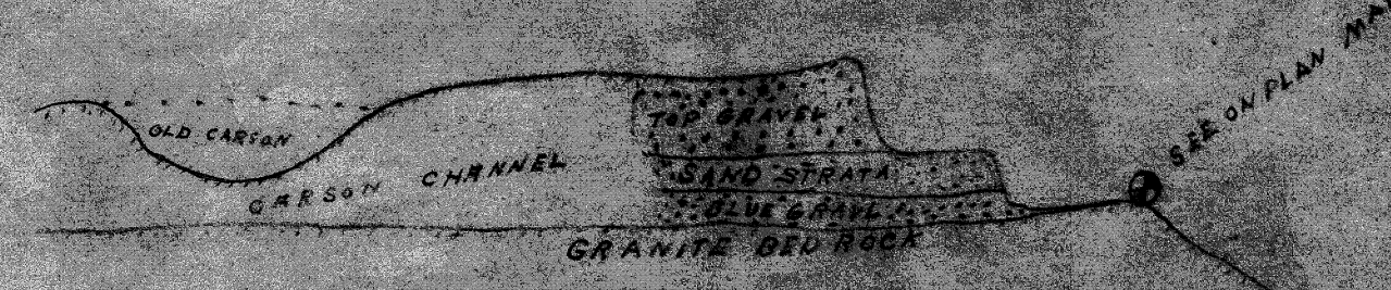
VERTICAL SECTION ON LINE OF CHANNEL SHOWING PROPOSED OPENING FROM OUTLET ON GRANDE RONDE RIVER + WORKING FACE IN TWO BENCHES - SAND STRATA TO BE BLASTED SCALE ONE INCH = 200 FT.

By T. R. OLIVER ABSTRACTOR, LA GRANDE, UNION CO. OREGON