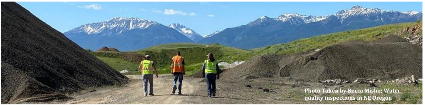
Water quality inspections in NE Oregon