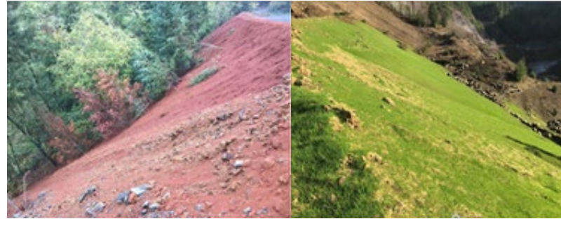
Slope before seeding