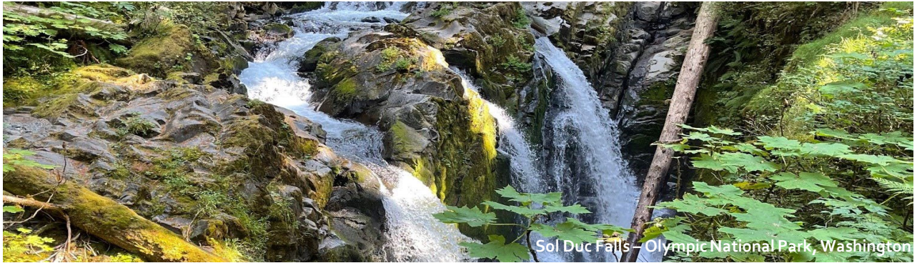
Sol Duc Falls – Olympic National Park, Washington