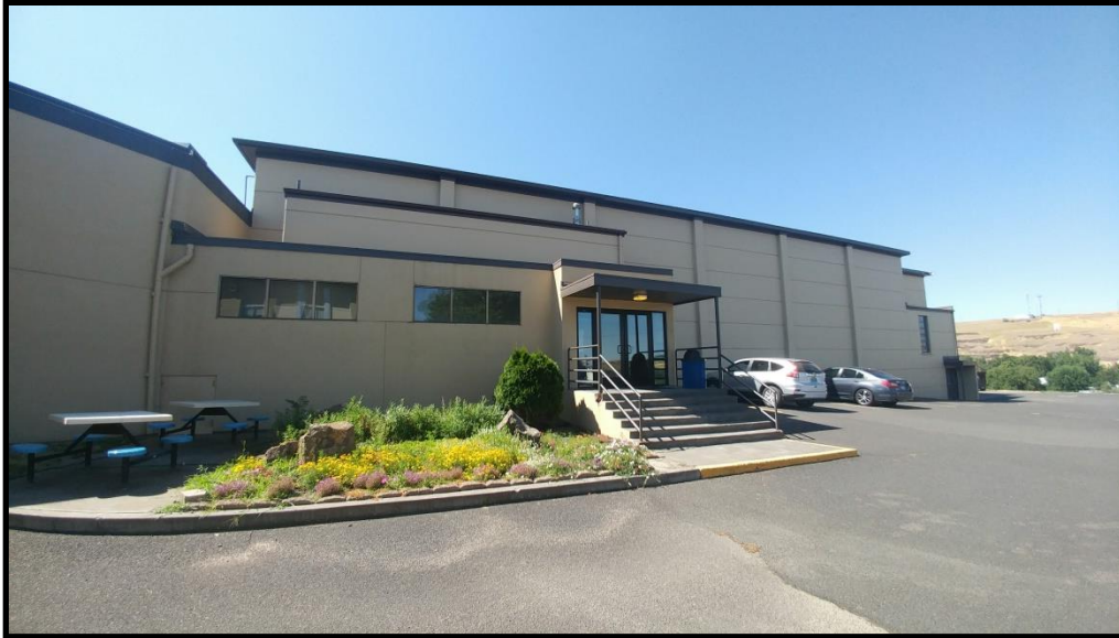
Figure 3: Pilot Rock High School