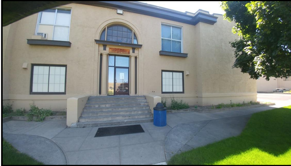
Figure 2: Pilot Rock Middle School