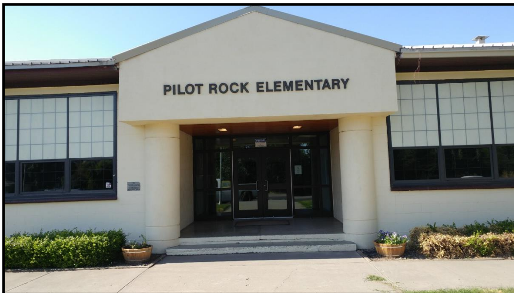
Figure 1: Pilot Rock Elementary School