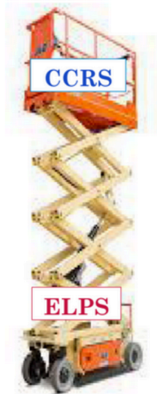
Figure 1 3

Oregon Adult English Language Proficiency Standards (OAELPS) are closely connected to the Oregon Adult College and Career Readiness Standards (OACCRS). OAELPS are intended to support English language ABS learners in meeting the OACCRS, whether they are in English language learning classes or in other types of ABS classes such as GED and Adult Education (see Figure 1). It is expected that as learners advance in their English language skills, there will be increasing use of OACCRS with decreasing OAELPS support, as illustrated in Figure 2 below.