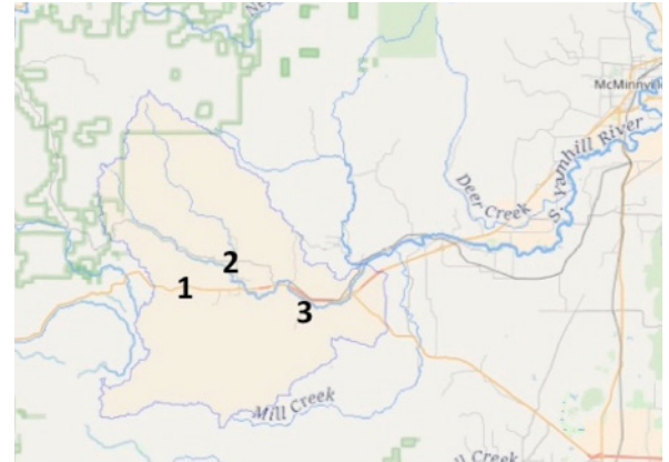
Water Quality Monitoring Locations 2015-17

► History: In 2010, the Oregon Department of Environmental Quality (DEQ) and the Oregon Department of Forestry (ODF) began discussions with the Confederated Tribes of the Grand Ronde and forest landowners to evaluate potential impacts to surface water bodies from herbicides used in the commercial forestry industry. The South Yamhill was selected because of the connection to the on-going Pesticide Stewardship Partnership (PSP) work in the central part of the Yamhill River Basin (near the city of McMinnville) and the level of private forest management activities by multiple land owners.