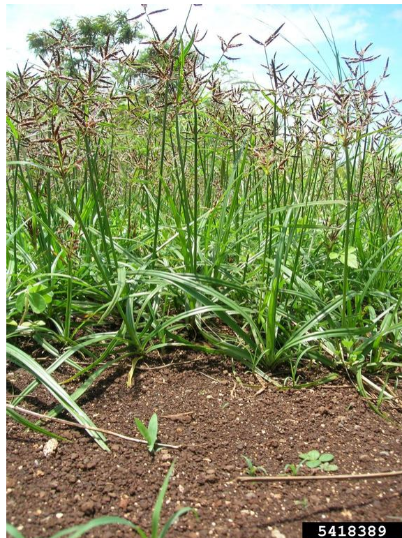
Purple nutsedge flower spikes, photo by Forest & Kim Starr, Starr Environmental, Bugwood.org