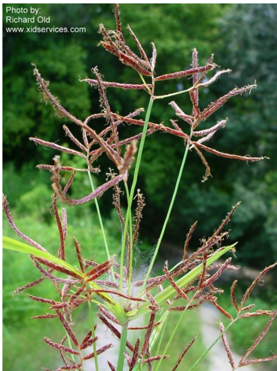
Purple nutsedge flower spikes, photo by Richard Old, XID Services, Inc., Bugwood.org

Introduction: Regarded to be the world’s worst weed, Cyperus rotundus causes serious problems in more crops in more countries than any other weed (Kadir et al., 2000). The nutsedge taxa were used by ancient people of the Nile Valley and eastern Mediterranean as food, perfume, and medicine. Although C. rotundus was used in production of these items, literary evidence from 1 st century Aegean scholar Dioscorides indicates that it was considered a weed escaping from its marshy native habitat and causing agricultural loss in cultivated fields of the area (Negbi, 1992). This perennial weed causes major agricultural problems in crops such as rice, sugarcane, cotton, corn, soybean, peanut, turf grasses, strawberry, and vegetables (Kadir et al., 2000). Overall, it infests 52 crops in 92 countries, and is present up to 2,500 meters (Jha et al., 1985).