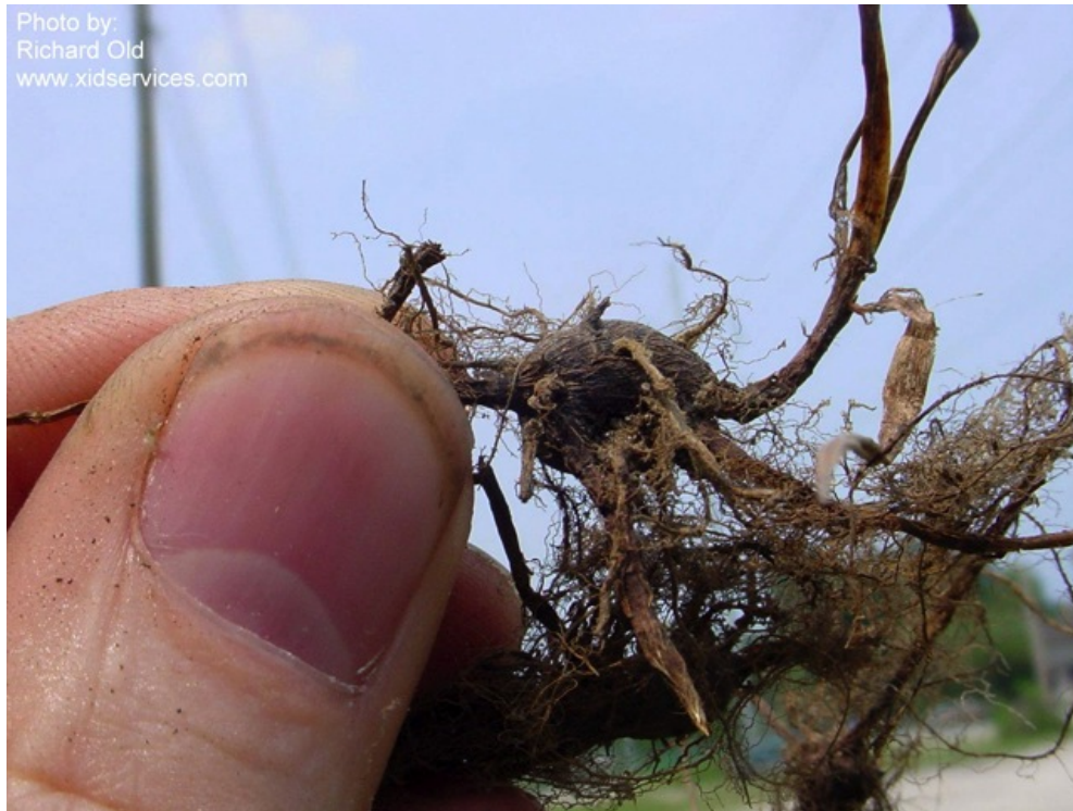
Purple nutsedge roots

Purple nutsedge has allelopathic traits that interfere with crops. Phenolic acids and other volatile compounds contained within the plant and its tubers limit growth of surrounding plants (Alsaadawi et al., 2009). It is widely distributed across the country, present in twenty-five states and two territories and is considered noxious in Washington, Oregon, California, and Arkansas (Skinner, 2010). Purple nutsedge is aggressive in a wide array of environments, being tolerant of wet soils and high temperatures. Its distribution increased rapidly due to monocultural practices, lack of crop rotations, and reduced use of hand cultivation (Kadir et al., 2000). Reproduction mainly takes place underground via vegetative propagules, although seeds produced by the plant are also viable and contribute to spread (Jha et al., 1985). Selective herbicides prior to 1987 were ineffective at translocating to the tuber system of C. rotundus that prevented death of the plant. Newer herbicides have proven to give better control. The only known incident of C. calcitrapa being within Oregon was at a greenhouse in Clackamas County in 1999 where the specimen was found in potting medium. Not enough material was present for an “absolutely positive ID” (Invaders Database, 2010).