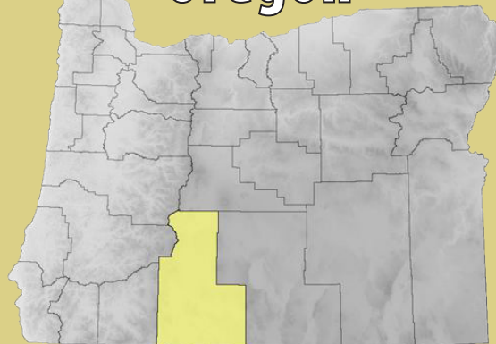
2014 Taurian Thistle