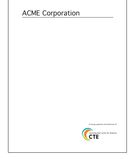
Figure 5. Sample letterhead showing relationship between corporate logo and CTE brand.