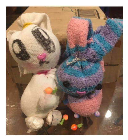
Sock Bunny Arts & Crafts Activity

Along with offering the ODE Farm to School grant-funded activities in April, NFK has expanded the organization's efforts responding to hunger and food instability. They are operating SFSP COVID-19 non-congregate feeding out of their site in Depoe Bay, preparing and distributing a healthy Breakfast and Lunch to children five days per week. The Cook also used Carrots in weekly meals, to help showcase the pick of the month. "The need is growing and we are proud to join the efforts of school districts and food pantries across the state, as we together support the needs of our communities," stated Toby J. Winn, NFK's Executive Director of Development.