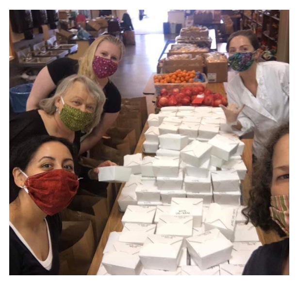
Staff preparing and distributing SFSP meals