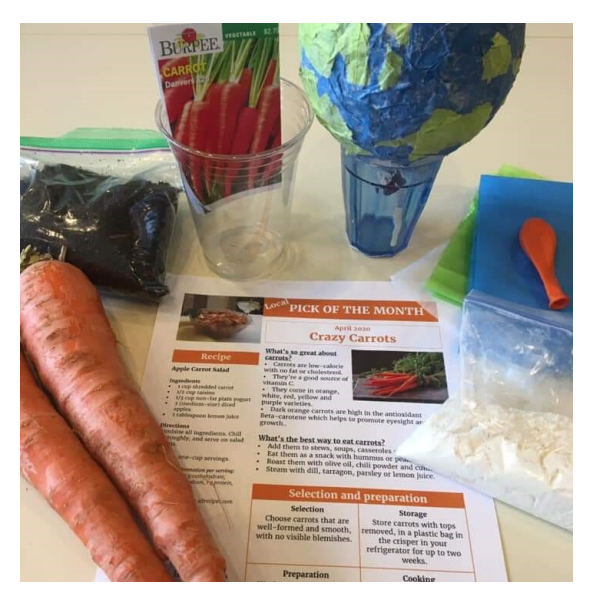
April Pick of the Month Activities -Carrots & Earth Day Activities