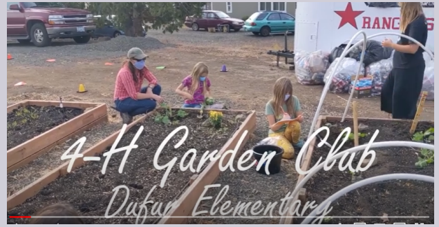
4-H Garden Club at Dufur Elementary in Dufur SD