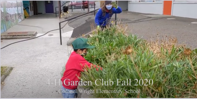
4-H Garden Club at Colonel Wright Elementary in North Wasco County SD