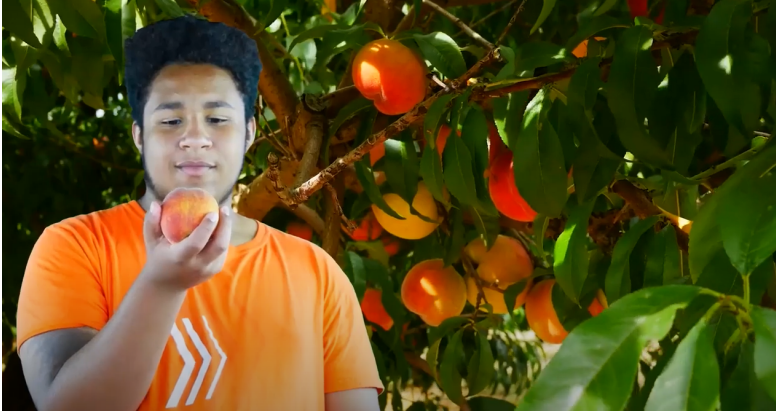
An English language version of the Peaches Video .

The month of March brings new additions to the Oregon Harvest for Schools (OH4S) video series; Peaches and Watermelon in English with Spanish versions coming soon!