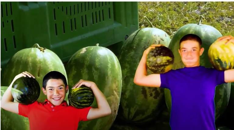
An English language version of the Watermelon Video .

The Oregon Department of Education's Child Nutrition Program and OSU Extension's Food Hero campaign have teamed up to launch this series which will include a total of 50 videos when complete. The series aims to educate students on healthy, Oregon food. For a comprehensive list of the videos we have available to date visit the Oregon Harvest for Schools website and click on the Videos tab under "Other Items."