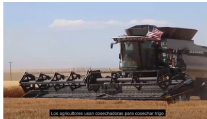
A Spanish language version of the Wheat video .

The Oregon Department of Education's Child Nutrition Program and OSU Extension's Food Hero campaign have teamed up to launch this series which will include a total of 47 videos when complete. The series aims to educate students on healthy, Oregon food. For a comprehensive list of the videos we have available to date visit the Oregon Harvest for Schools website and click on the Videos tab under "Other Items."