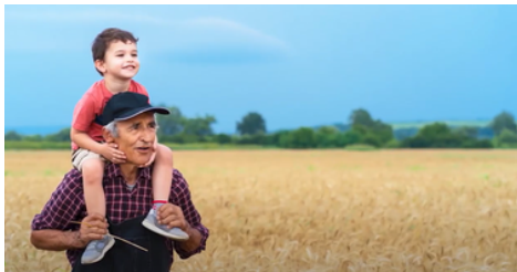
An English language version of the Wheat video .