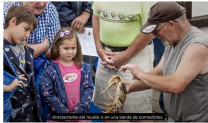
A Spanish language version of the Seafood video .