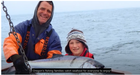
An English language version of the Seafood video .

The month of February brings new additions to the Oregon Harvest for Schools (OH4S) video series; Seafood in English and Spanish and Wheat in English and Spanish!