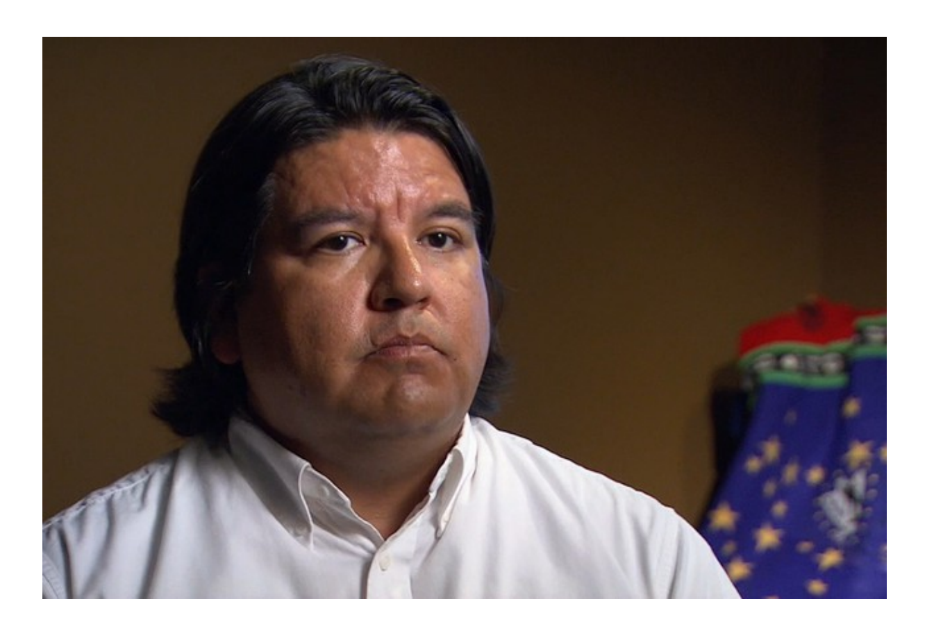
"They did so reserving our rights to all our usual and accustomed places so that we can hunt, fish, and gather — (it) is a critical part of that. They knew seven generations down the line that would be important to those children after them."