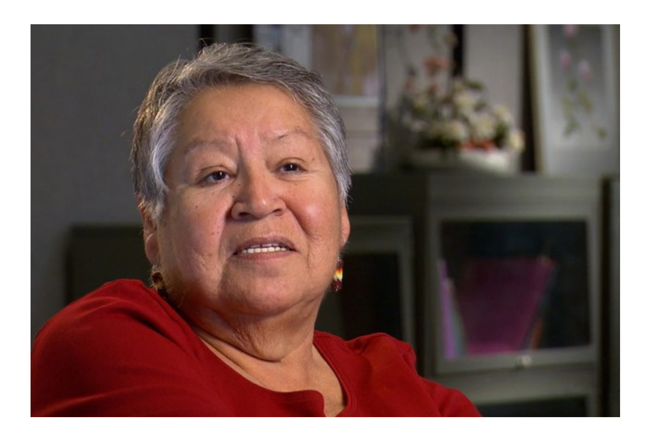
"I think the distinction was our ability to thrive and to live in country that other people found less desirable."