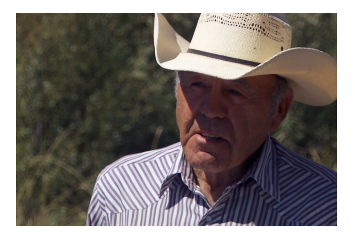
"The courts determined that the Klamath Tribes had senior water rights throughout the former reservation and that caused a lot of contention of non-tribal members here that depended on it. ... But the tribes [have] always been willing to share, and we're sharing some of that water today."