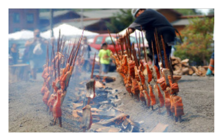
Salmon cooking at a traditional ceremony.

purpose of the ceremony is to thank the Creator for giving salmon as a first food. The ceremony also honors the Salmon for keeping their promise to return each year. Everyone in the tribe participates in a feast the focuses on the first salmon. Tribal leaders usually let the salmon pass through the rivers for a few days. They limit the number of fish that can be taken. This protects the future so that enough fish can spawn. Later, open fishing is allowed for everyone.