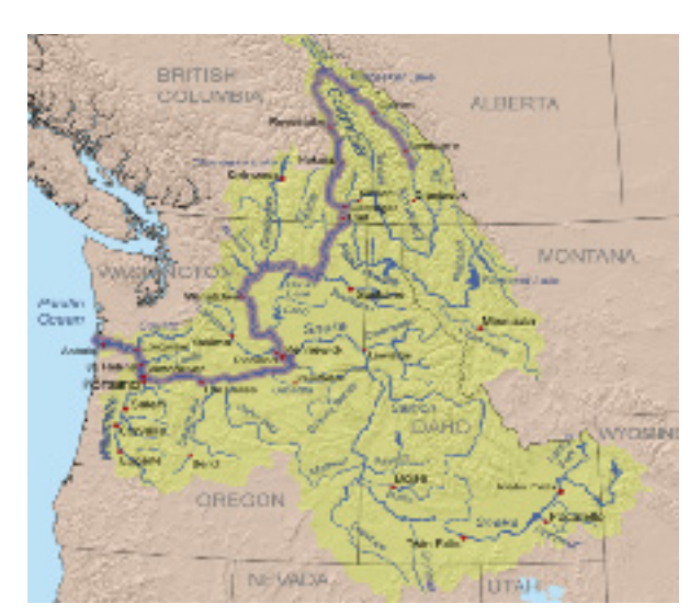
The Columbia River and its tributaries.

upstream to the Columbia River tributaries. Tributaries are rivers and streams that empty into other rivers. They swam through Oregon, Washington, Idaho, and British Columbia to get to their home stream. Salmon were also plentiful in many other Oregon rivers that emptied directly into the Pacific Ocean. The tribes that lived directly along the Columbia River and the Oregon Coast had the easiest access to salmon. However, all nine of the Oregon tribes have deep connections to salmon.