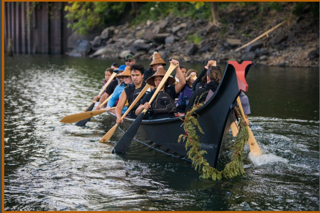
Grand Ronde Tribal members paddling Grand Ronde's canoe, Stank'iya

They wanted to make sure they, as a people, had control over their own property, people, and rights.