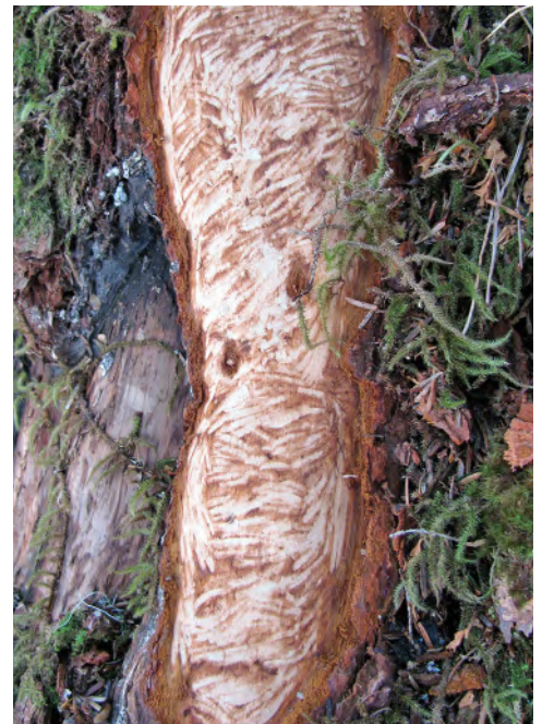
Flickr, Porcupine wound teeth-marks. Photo by Robin Mulvey