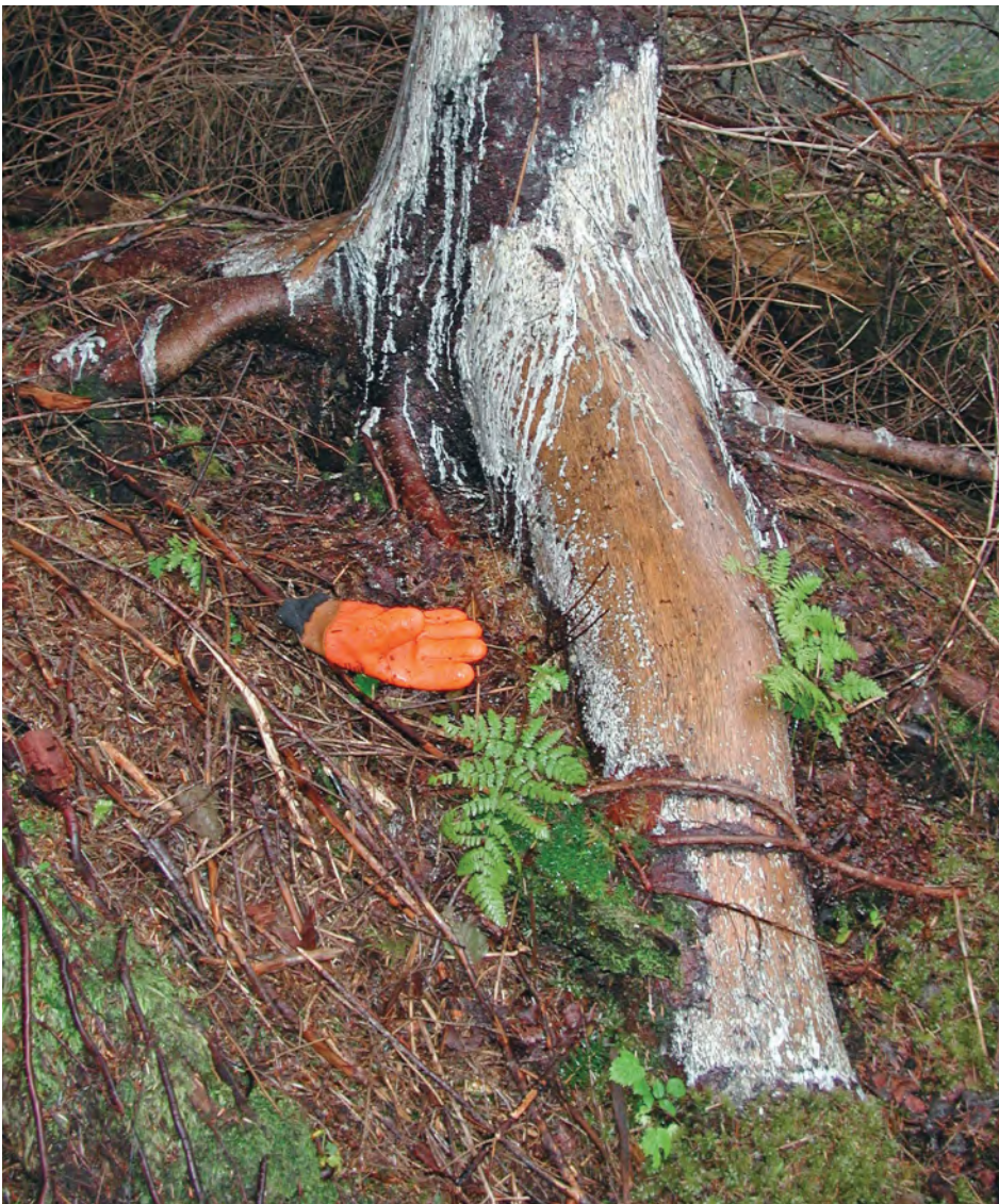
Porcupine Root and Bole Damage.