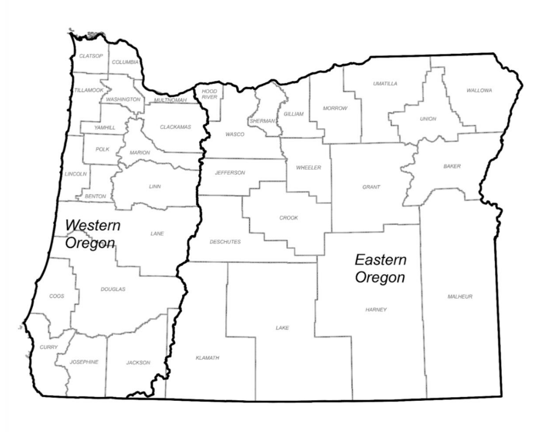
Figure 1: Western Oregon and Eastern Oregon Geographic Regions

Western Oregon and Eastern Oregon, respectively. The boundaries and names of the geographic regions are displayed in Figure 1 in OAR 629-643-0000. Geographic regions are not forest regions established pursuant to ORS 527.640.