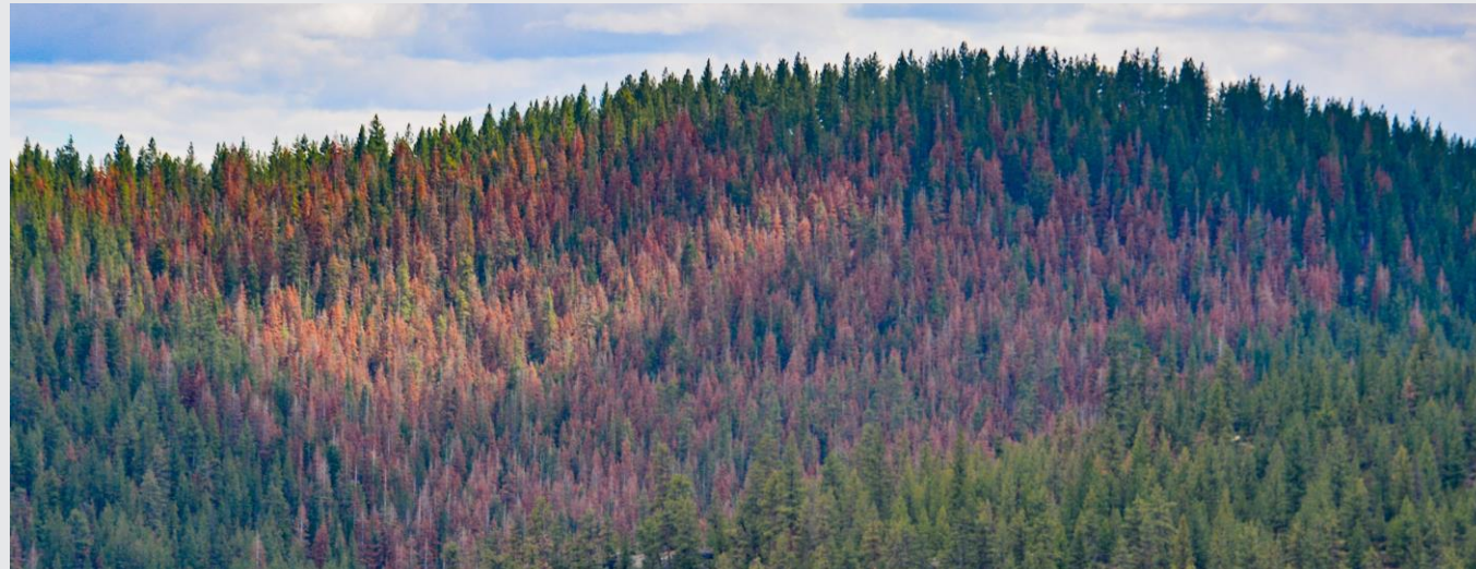
"Firmageddon": over 1 million acres of dead true fir detected in 2022 aerial surveys

Between ongoing hot droughts and wildfires