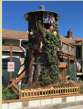
"No place like home..." an Unusual Tree Stump in Salem

Oregon Arbor Week is traditionally observed the