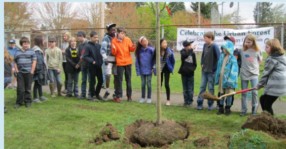
2015 Arbor Day Planting in Forest Grove