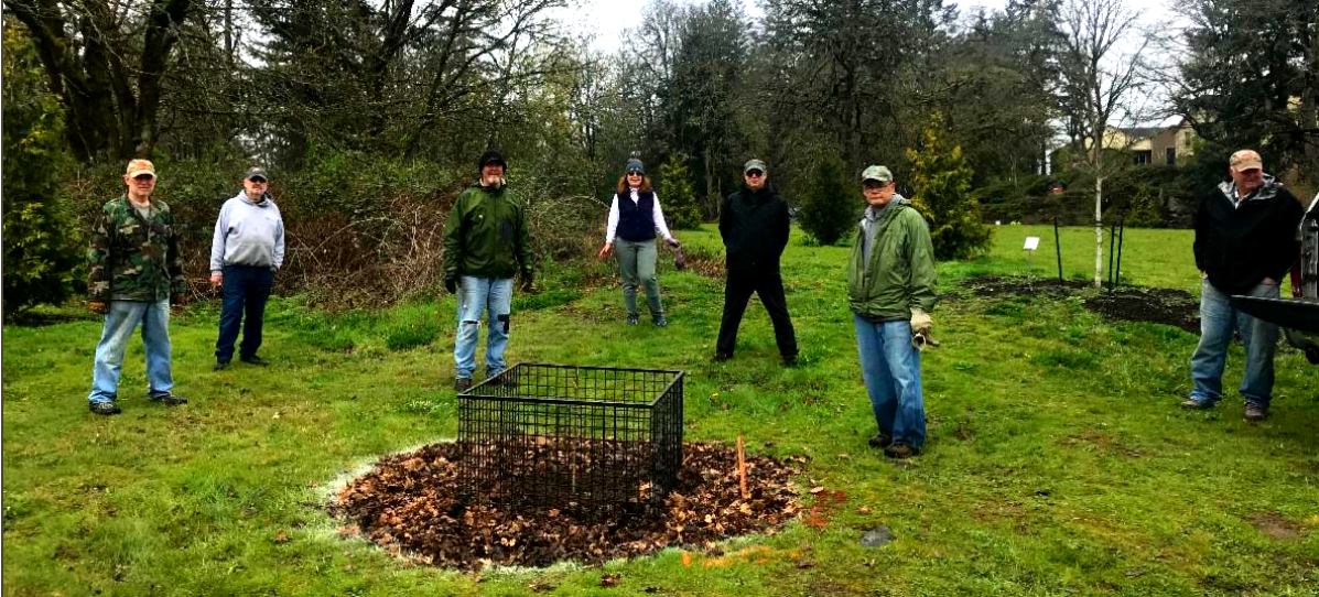
Gladstone residents and staff recently planted their Hiroshima Peace tree by following ODF's planting and protection instructions while maintaining the necessary physical distance to discourage COVID19 transmission.

The Newsletter of Oregon's Urban & Community Forestry Assistance Program