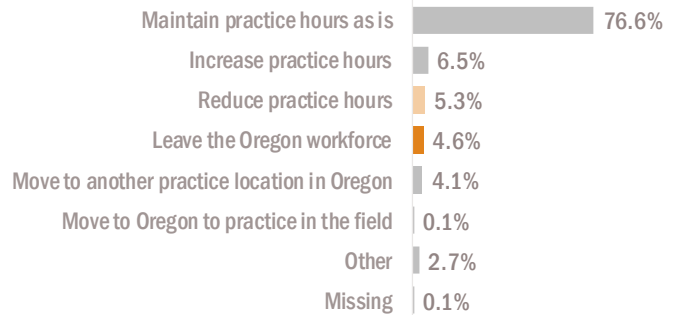
Figure 1. Practice plans in the next two years