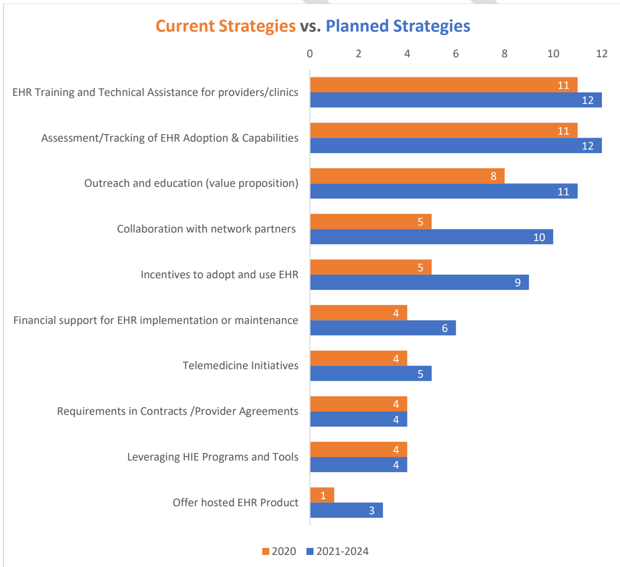
Figure 1: 2020 & 2021-2024 Strategy Comparison

The figure below represents the number of CCO organizations that reported using the different strategies in the 2020 Progress and 2021-2024 Plans sections of their Updated HIT Roadmap. It is assumed that 2020 strategies will remain in 2021-2024 Plans. Please see the Appendix – Table 1 for additional details on what has been included in each strategy category.