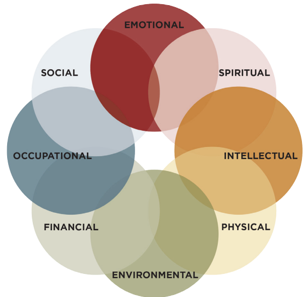
EIGHT DIMENSIONS OF WELLNESS*

We also recognize that we live in a multicultural world, and wellness encompasses areas that may not be specified in this brief discussion. We believe, for example, that trauma is a universal human experience, and that our culture and spiritual beliefs impact our perceptions and everything we do. In summary, wellness is about how we live our lives and the joy and fulfillment and health we experience.