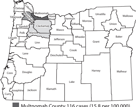
Figure 3. Early syphilis cases by county of residence, 2011.

Multnomah County 116 cases (15.8 per 100,000) Washington County 23 cases (4.8 per 100,000) Clackamas County 6 cases (1.6 per 100,000) Marion County 4 cases (1.3 per 100,000) All other counties ≤2 cases